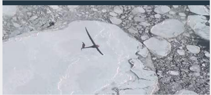
Vanilla gathers snow and ice thickness RADAR data in the Arctic Circle